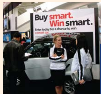
Discus Dental representatives pass out registration forms in front of the smart car on display at their booth. Dental professionals who fill out the form have an opportunity to win the car!