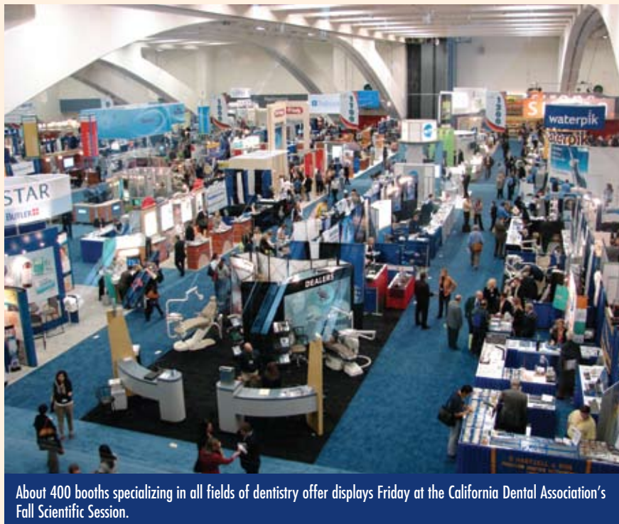
About 400 booths specializing in all fields of dentistry offer displays Friday at the California Dental Association's Fall Scientific Session.

hall as a visual you couldn't miss. The mobile service allows dentists to offer high-quality cone beam CT scans without necessarily having to purchase the equipment individually. "We travel to the dentist's